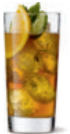
PIMMS: ABV 25% 1.3 UNITS