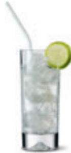
SINGLE GIN & TONIC: ABV 40% 1 UNIT