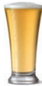
HALF PINT LAGER: ABV 5.2% 1.5 UNITS