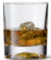
DOUBLE WHISKY: ABV 40% 2 UNITS