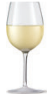
WHITE WINE (175ML): ABV 13% 2.3 UNITS