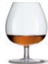
DOUBLE COGNAC: ABV 40% 2 UNITS