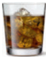
DOUBLE WHISKY & COKE: ABV 40% 2 UNITS