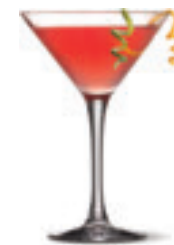
COSMOPOLITAN COCKTAIL 2 UNITS