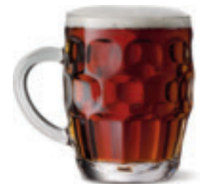
PINT BITTER: ABV 5% 2.8 UNITS