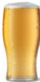
PINT LAGER: ABV 5.2% 3 UNITS