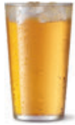
PINT CIDER: ABV 5.3% 3 UNITS

More than 1 in 4 adults are currently drinking above lower risk limits.